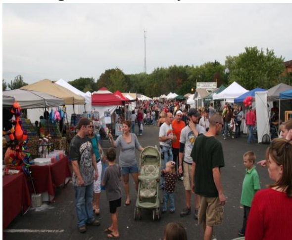
Vendors and Crowds at Mapleside Farms

Mapleside Johnny Appleseed Festival - was a big success with over 20,000 people attending over the two days!